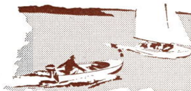
1. Sailboats and rowboats without motors have the right of way over outboards.