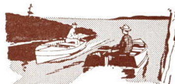
2. Keep on the right side of a narrow channel or canal.