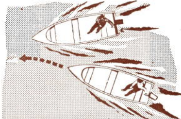
4. When approaching another boat at an angle, give way if she's off your starboard beam (the rule you know on the highways: give way at an intersection to the car at your right).